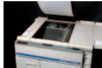
Prevention of toner adhesion on copier rolls

Applications: Oil baths, heating mediums, and vibration reduction oils for instruments to be used in high-temperature environments. Mold releasing agents for molten metal.