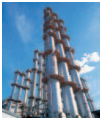
High temperature heating medium