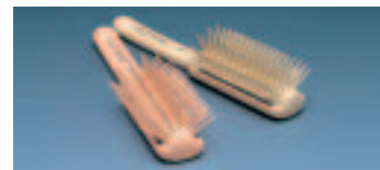
Hairbrush lubrication (silicone fluid impregnated plastic)

Applications: Water repellency processing of textiles, glass, metal, and ceramic materials. Enhancement of fluidity in various inorganic powders.