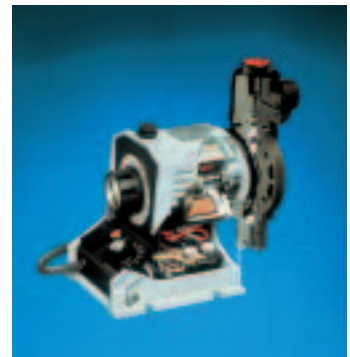
Lubricants for instruments