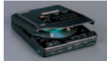
Vibration reduction oil for compact disks

Applications: Oil baths, heating mediums, and damping and vibration reduction oils for instruments to be used in high-temperature environments. Cosmetic additives.