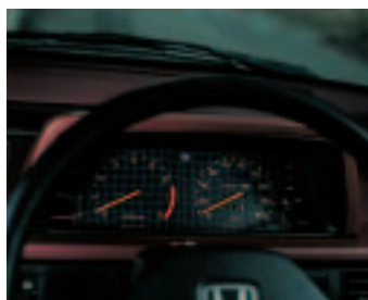
Damping/vibration reduction for instruments