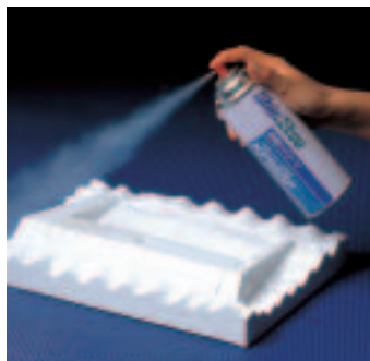
Mold releasing agent for rubber products