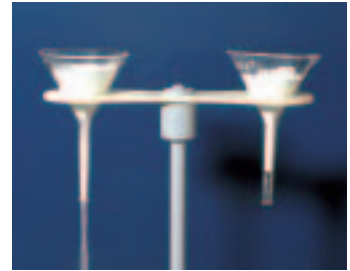
Improved fluidity of powders

For more information, please refer to our technical materials.